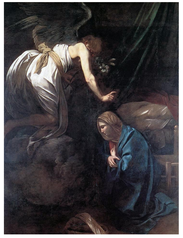
Annunciation, Caravaggio, 1608