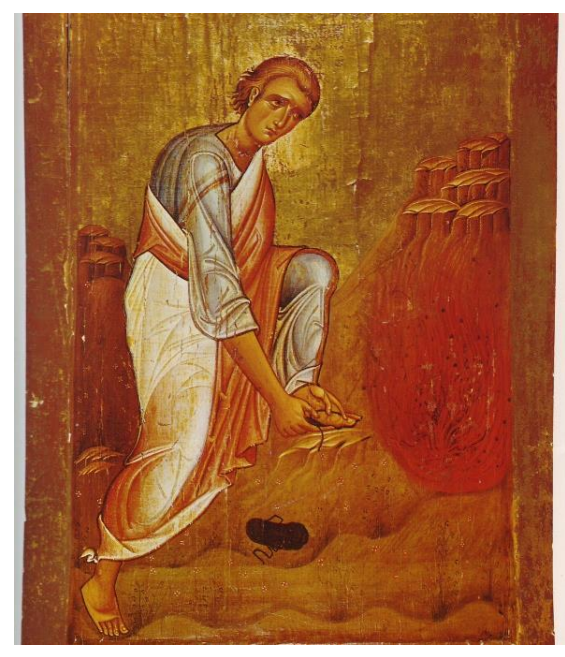
Moses and the burning bush, Icon, Saint Catherine's Monastery, Sinai, c.12th century, Source: Wikimedia Commons