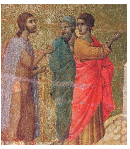
Christ on the road to Emmaus (Fragment), Duccio, 1308–1311, Source: Wikiart