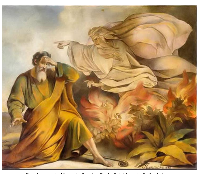
God Appears to Moses in Burning Bush, Saint Isaac's Cathedral, Saint Petersburg, 1848, Source: Wikimedia Commons