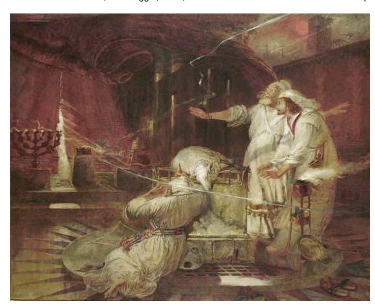
Rending of the veil, William Bell Scott, 1869