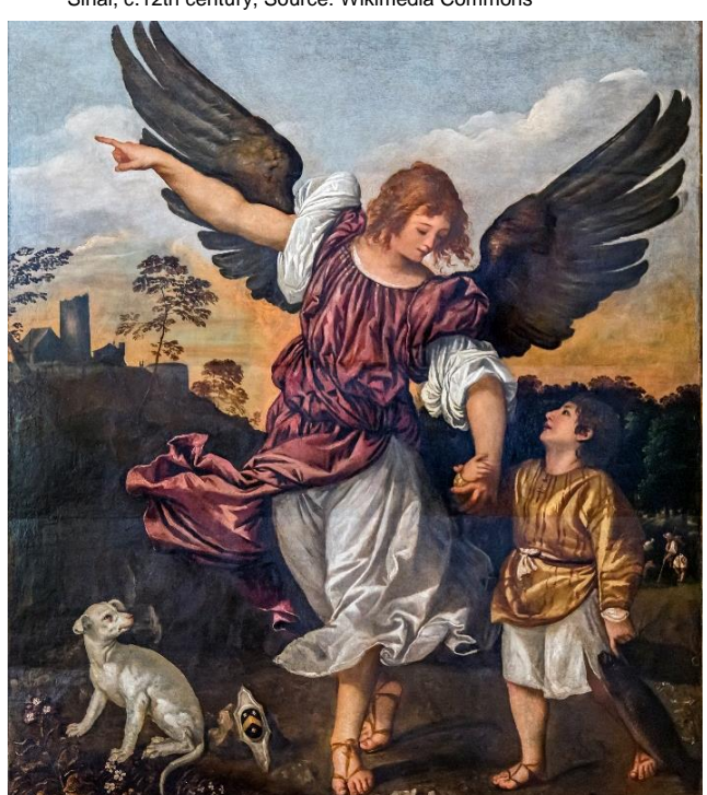
Archangel Raphael and Tobit, Titian, c.1542